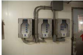
Regular checks by trained people (at least every week)